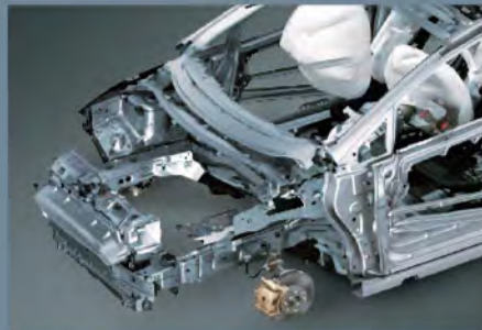
ULTRA HI-STRENGTH STEEL BODY

The All New Ford Fiesta's stylish body is reinforced with Boron Steel that is four times stronger and yet incredibly lighter. Safety is further reinforced by driver and passenger airbags. The standard Anti-lock Braking System with Electronic Brakeforce Distribution (ABS with EBD) gives you complete control, even upon sudden braking or unexpected swerving.