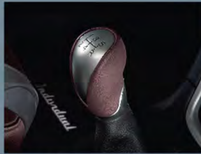
LEATHER GEAR KNOB