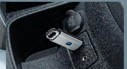
USB / AUX-IN CONNECTIVITY