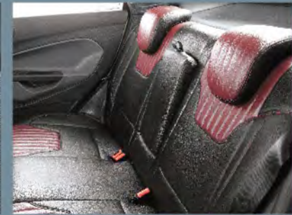
LEATHER VINYL SEAT COVERS

Interior personalisation pack available in Plum Red and Oceanic Blue.