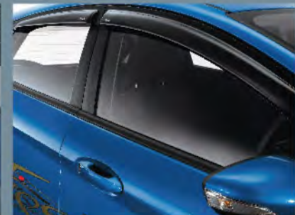
PREMIUM SLIMLINE WEATHERSHIELD