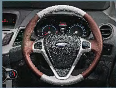
LEATHER STEERING WHEEL - PLUM RED (AUDIO CONTROLS)