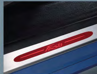
ILLUMINATED DOOR SCUFF PLATES