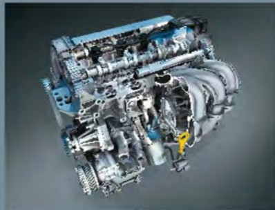
1.5l TiVCT AND 1.5l TDCi ENGINE

Available in both Manual and Automatic Transmission