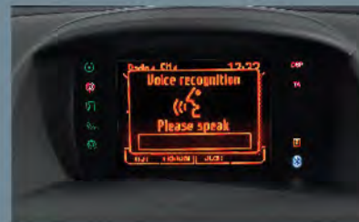
3.5 INCH HI-RESOLUTION LCD DISPLAY