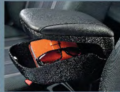
ARM REST WITH STOWAGE