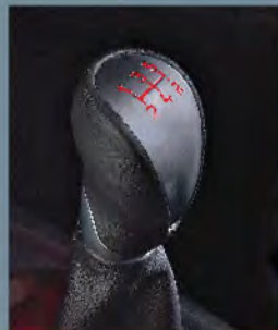
ILLUMINATED GEAR KNOB