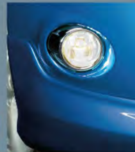
FRONT FOGLAMP KIT