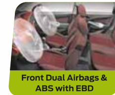
Front Dual Airbags & ABS with EBD