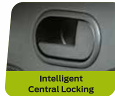
Intelligent Central Locking