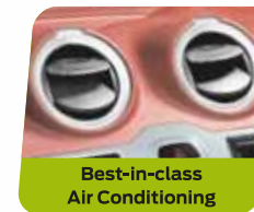
Best-in-class Air Conditioning