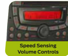
Speed Sensing Volume Controls