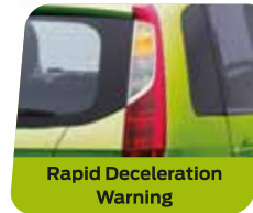
Rapid Deceleration Warning