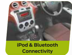
iPod & Bluetooth Connectivity