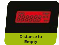
Distance to Empty