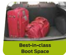
Best-in-class Boot Space